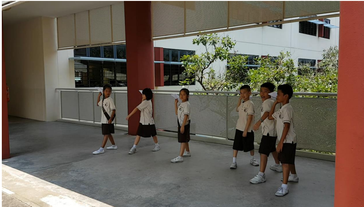
Test Flight : Paper Aeroplane